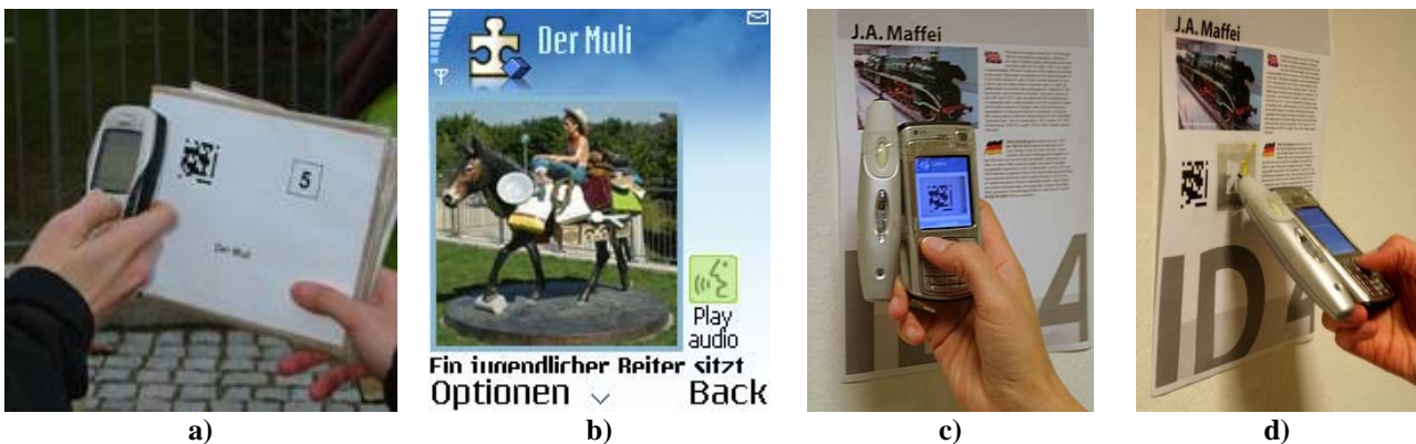
Figure 1: The MOPS (a,b) and MOPS++ (c,d) guiding applications (from [6])

MOPS (MOBILE Petuelpark System) is a mobile guiding application that is inspired by similar applications like the Cyberguide [1] and which provides its users with information about exhibits in the Petuelpark in Munich, Germany through Physical Mobile Interaction (see [6]). The objects in the park were augmented with information signs showing a number identifier and a visual marker. Users can acquire information about exhibits by taking pictures of their visual markers, typing their number identifiers (see Figure 1a) or by entering a certain area around each exhibit which is determined by an external GPS-device. Upon interaction, the application displays the names of selected exhibits, a picture, textual information and an audio file (see Figure 1b).